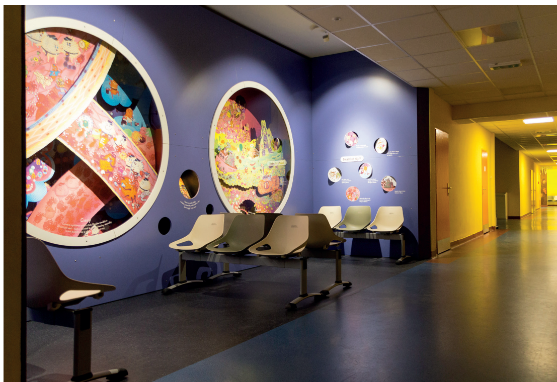
Waiting room at the Radiology Clinic, Kramáre Children's Hospital, the ASIL project