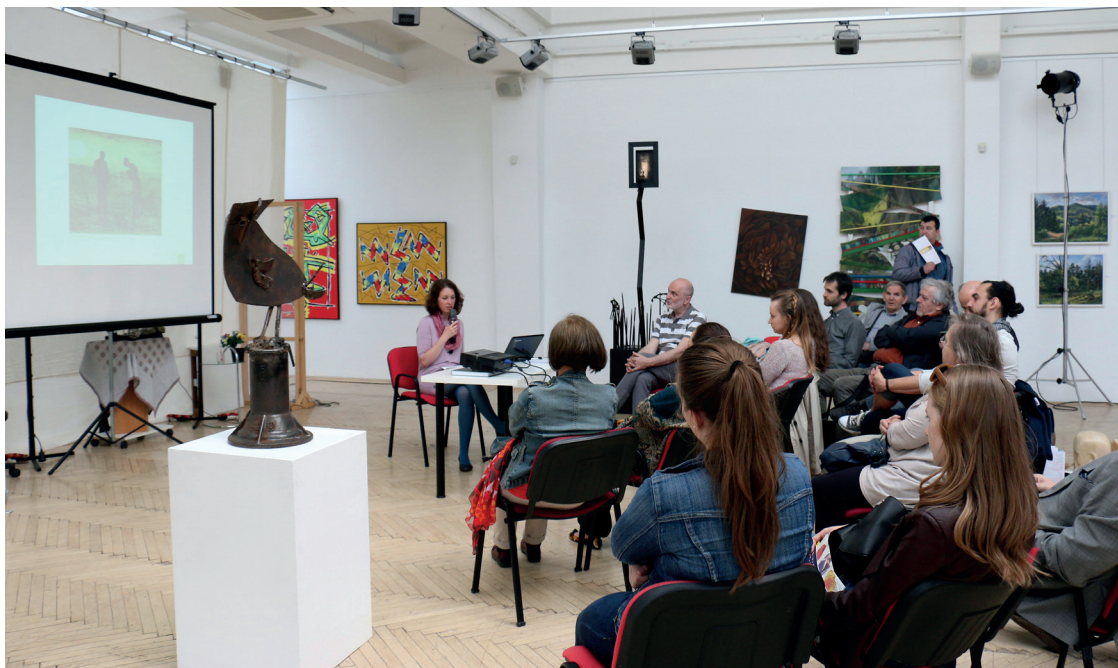
Debate at the Slovak Union of Visual Arts on „Right to remuneration for resale of an original work of visual arts“, May 20, 2017

(more details at: http://www.lita.sk/magazin/za-dverami-detskej-nemocnice-sa-skryva-necakane-vela-umenia )