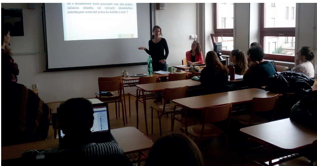
Lecture on copyright at the Department of Cultural Studies of the Faculty of Arts of the Constantine Philosopher University in Nitra, November 29, 2017