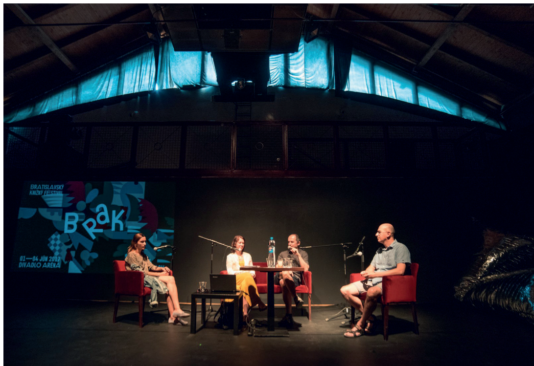
Debate at the Bratislava Book Festival (BRaK), June 3, 2017

in exercise of authors' rights in various areas of use of works, impact of the European case-law on practice, and discussed other important issues related to the collective management of authors' rights.